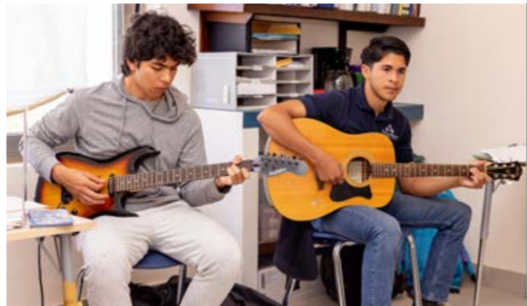
High School Music Club